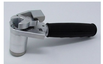
Table tools/accessories PowerClip®