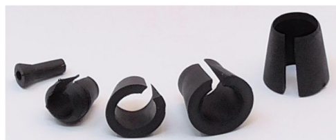
Table sealing gaskets

Sealing gaskets are available for common micro ducts and applicable cable diameters. Sealing gaskets are made from thermoplastic rubber (TPV) Santoprene™. Slotted version of WGT works also like a blind plug with sealing gasket from shut version (on request). Select sealing gasket according to your WGT size and cable diameter from table below and specify number with order. Customer specific gaskets are available on request.